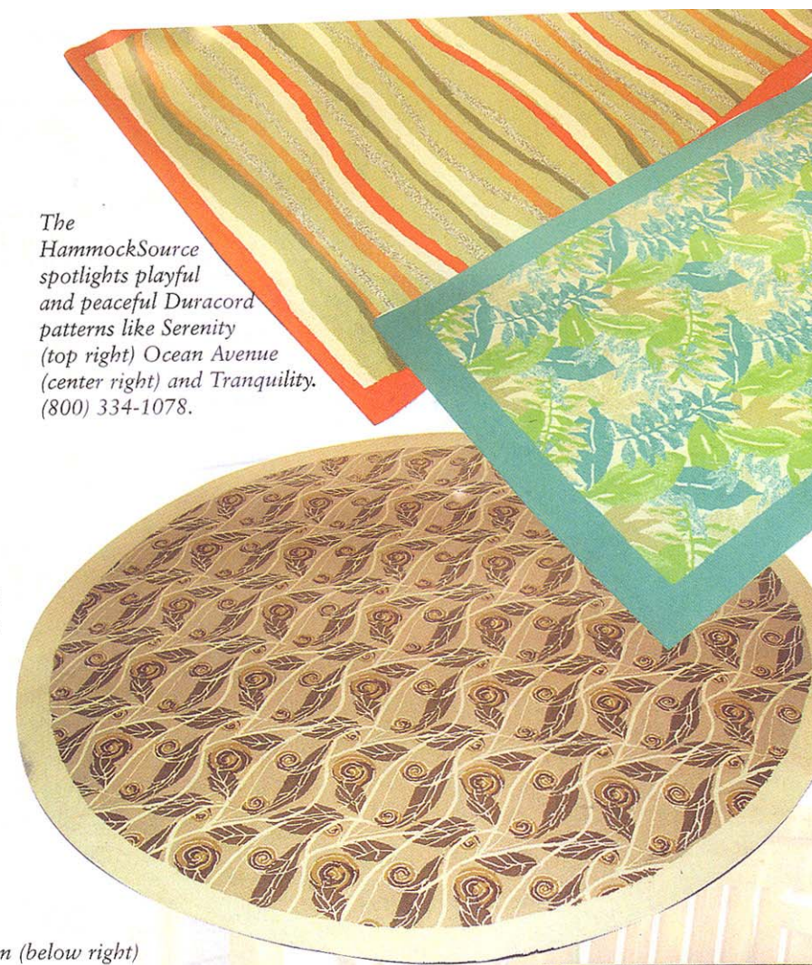
The HammockSource spotlights playful and peaceful Duracord patterns like Serenity (top right) Ocean Avenue (center right) and Tranquility. (800) 334-1078.