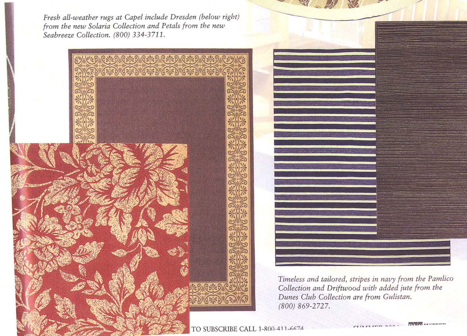
Fresh all-weather rugs at Capel include Dresden (below right) from the new Solaria Collection and Petals from the new Seabreeze Collection. (800) 334-3711.