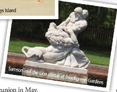
Samson and the Lion statue at Brookgreen Gardens

For deep-sea fishing there are several marinas on the inlet where you can charter a boat and hook everything from sea bass to snapper and grouper. If you'd rather have someone else catch your fish, there's no shortage of great restaurants at Murrells Inlet, which bills itself as the Seafood Capital of the South and even claims it's where hushpuppies were invented.