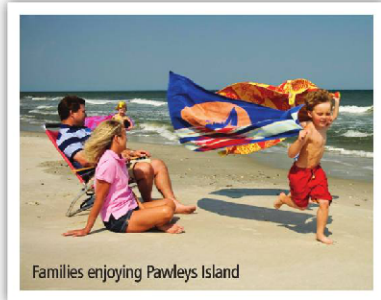
Families enjoying Pawleys Island

Restaurants in Pawleys Island range from fine-dining establishments like AAA Three Diamond Frank's Restaurant & Bar, which specializes in delectable steaks, or more casual fare at places like Quigley's Pint & Plate Restaurant, where you can enjoy